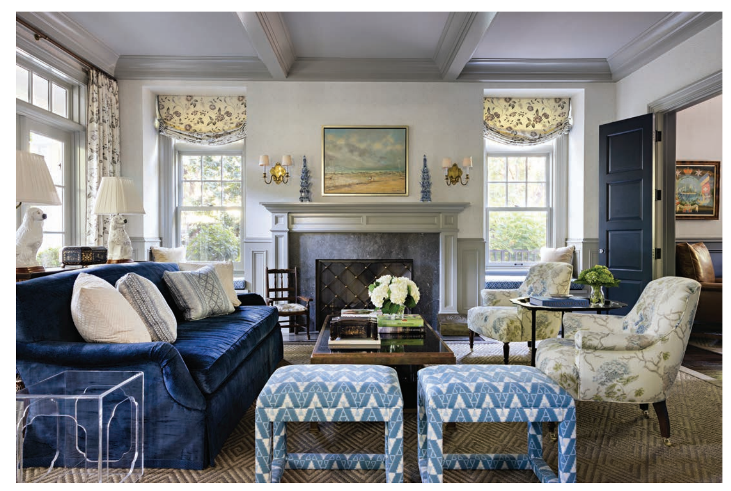
Rebecca Atwood wallpaper is used for the living room, with the area rug by Stark Carpets. The stools are upholstered in fabric from Bennison Aksum and chairs upholstered in fabric from Lee Jofa.