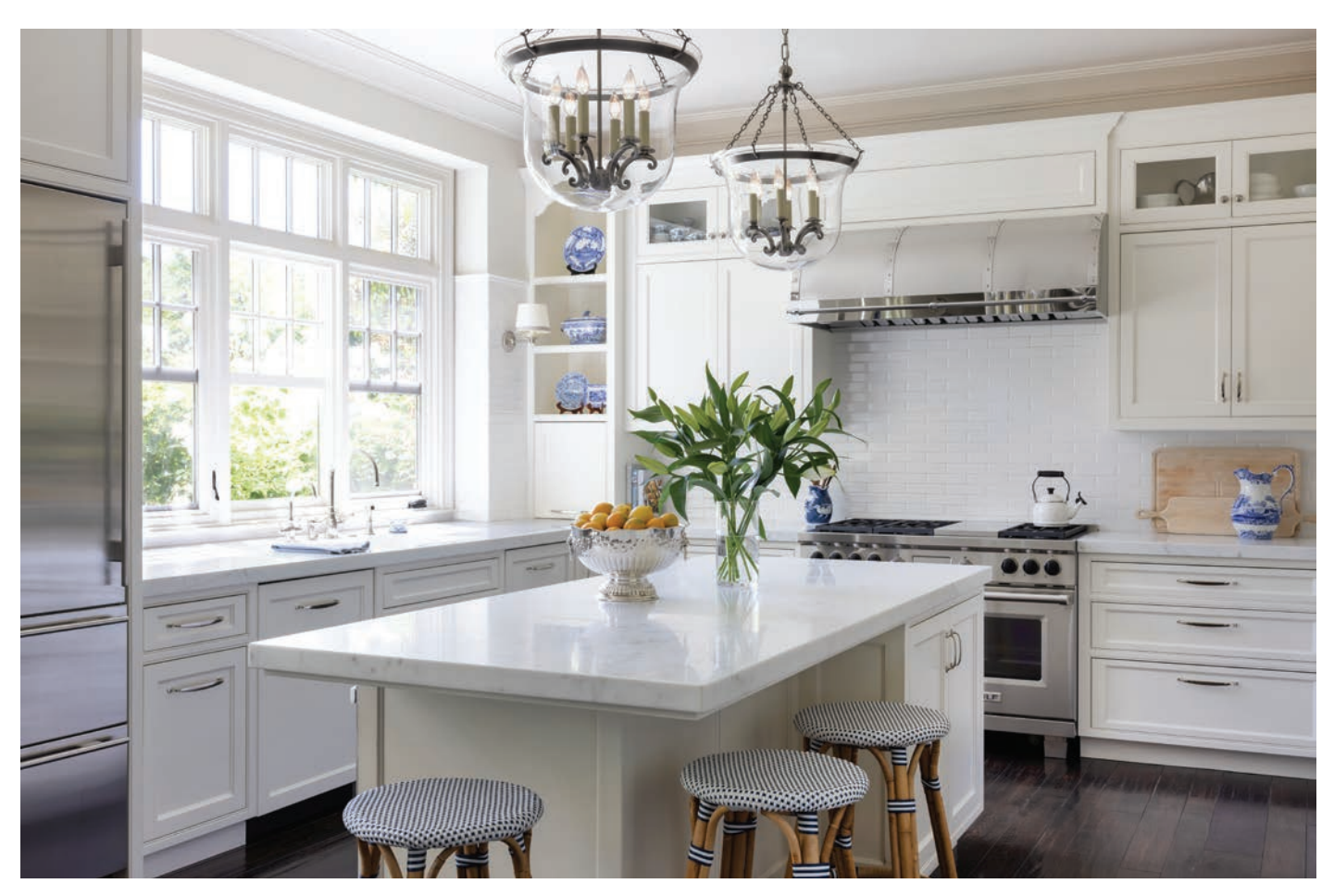
ABOVE Stools in the kitchen are by Serena and Lily, with lanterns from Visual Comfort.

"There's a formality to the dining and living rooms and when you go into the family room, there are navy blue bookshelves that feel like they have layers, and have been there a long time."