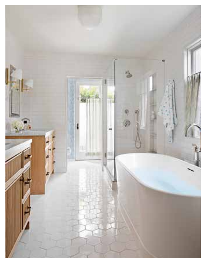
PRIMARY BATHROOM O'Dorisio designed the tiled room to match the home's European feel. Floor and wall tile: <a href="Ann Sacks">Ann Sacks</a>. Bathtub: <a href="MTI Baths">MTI Baths</a>.